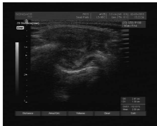
Figure 2. Ultrasound (US) scan of the 2-year old girl. Neurogenic tumor of the rib (measurements).

and management in the hope of reducing mortality and suffering from a disease. [6] Screening exam should applicate the simple test, characterized by high sensitivity and specificity. [7] Nowadays it is difficult to imagine modern diagnostics without US. Due to its noninvasive nature, US examination is especially recommended for children, but until now it was not applied in extensive screening. The reason for this could be its low sensitivity and specificity, but in fact this has not been investigated. Some attempts of US screening had been made in the diagnosis of urinary tract abnormalities, brain or adrenal hemorrhage in newborn infants and in patients with cancer predisposition, for example, in children with Beckwith–Wiedemann syndrome. [1,2,8] In Poland, the pilot program of early detection of neoplasms, such as Wilms tumor and neuroblastoma, was introduced. Within it, screening US including cervical, abdominal, pelvical, and scrotal US were performed. Since the peak incidence of these neoplasms