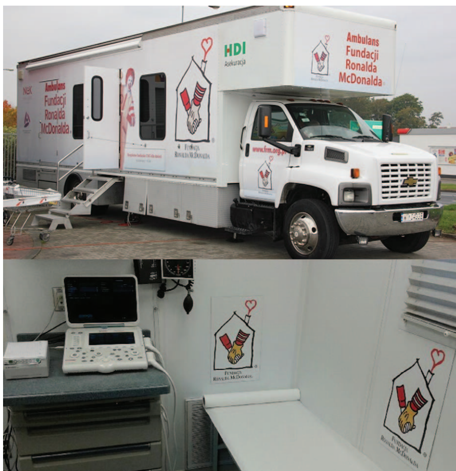
Figure 1. The ambulance (upper image) with pediatric ultrasound (US) unit (bottom image).

program; however, only small part of the population could benefit from the studies. The children were scanned in Mobile Pediatric US Unit, containing of 2 independent consulting rooms (Fig. 1). Informed consent was received from all parents in this study. The ambulance traveled around the country, mainly to the urban centers. Two experienced pediatric radiologists performed examinations simultaneously, overall 12 pediatric radiologists took part in the project. All scans were performed according to standardized protocols.